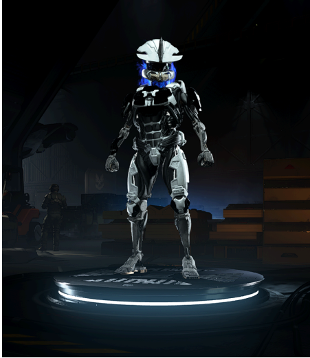
(fig. 7) - Use of the Tormenter helmet